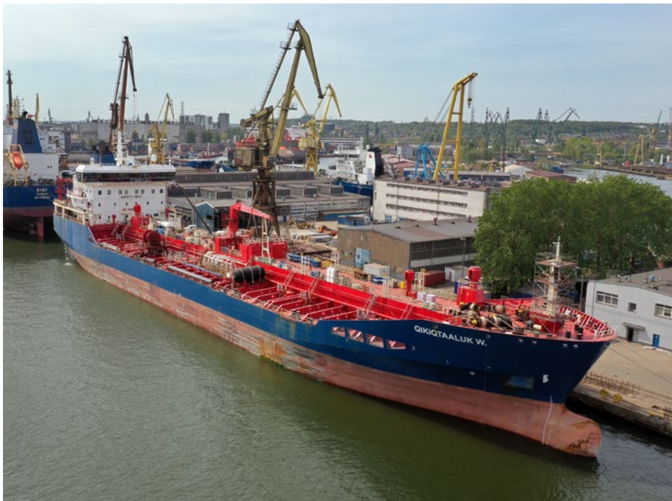
The Qikiqtaaluk W. moored at the Remontowa's quay

steel was replaced in several places. One of the mooring winches underwent a comprehensive overhaul, requiring the disassembly of components and machining in the shipyard's workshop. In addition, the winch brakes were replaced, and clutch components were fixed.